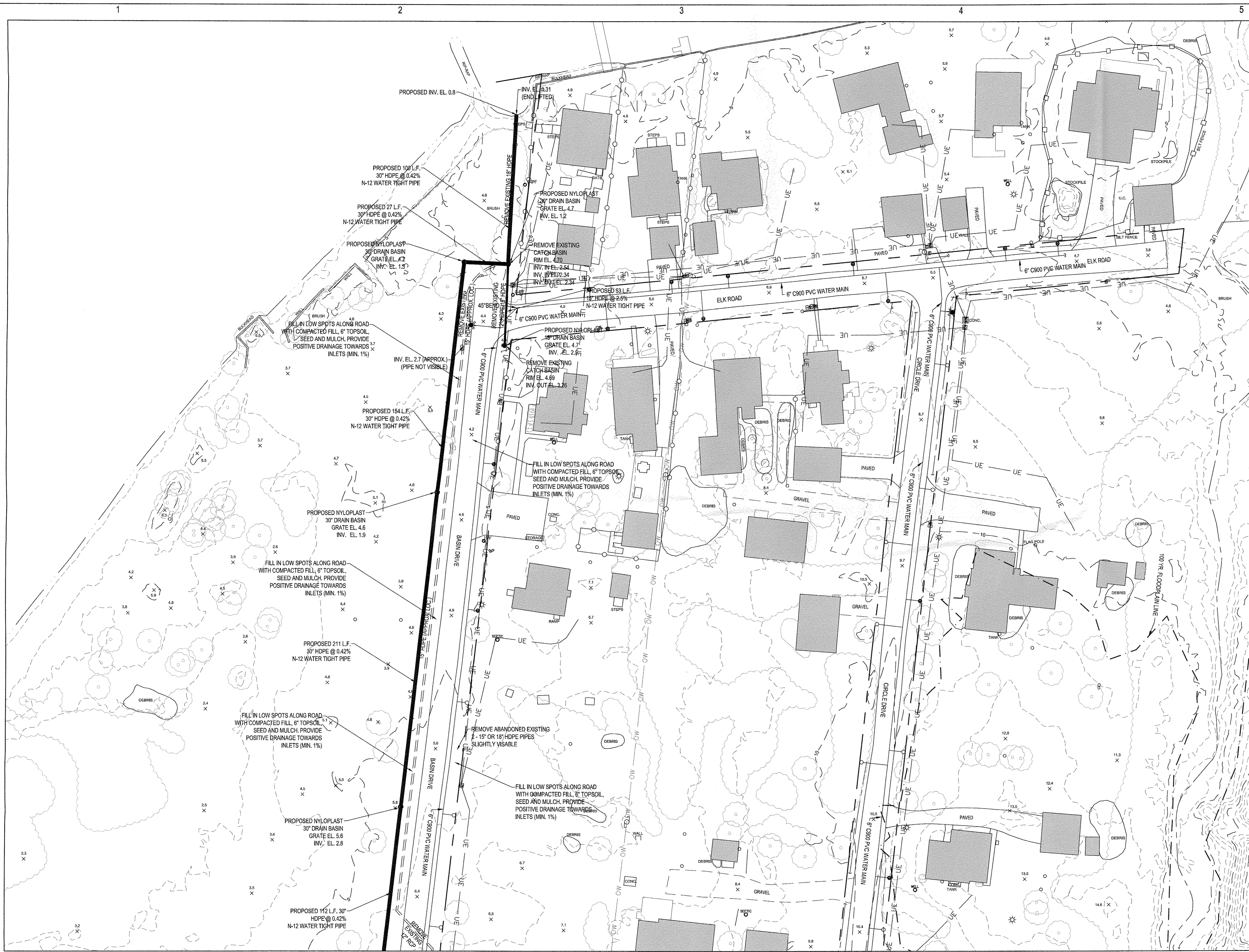
SITE PLAN SCALE: 1" = 30'

THIS DRAWING DOES NOT INCLUDE NECESSARY COMPONENTS FOR CONSTRUCTION SAFETY. ALL CONSTRUCTION MUST BE DONE IN COMPLIANCE WITH THE CURRENT OCCUPATIONAL SAFETY AND HEALTH ACT AND ALL RULES AND REGULATIONS THEREOF AND APPURTENANT.